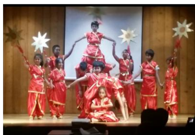
Children of Irvine, CA, presenting Sun Salutation in a Dance form.