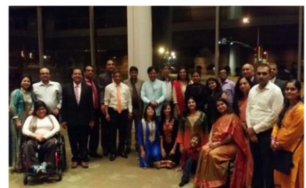
Chicago, IL, SAC show supported most children (191) in Bharat .