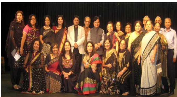
Cincinnati, OH, SAC show had an evening full of laughter along with mesmerizing classical and semi-classical dance performances.