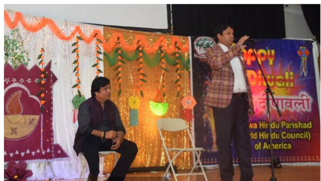
In Atlanta, GA, SAC show held along with Deepawali celebration was enjoyed by 650 attendees..