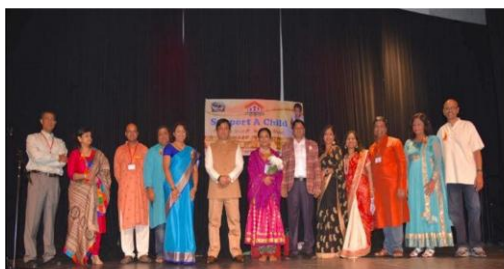
First time held SAC show in Dallas, TX, was a huge success.